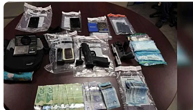
Guns, drugs seized in Sarnia traffic stop Sarnia News Today