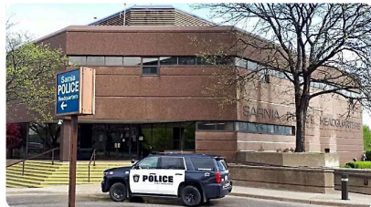
Sarnia man racks up $22K in fake credit card charges Sarnia News Today