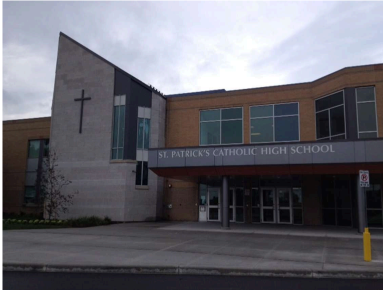
St. Patrick's High School.