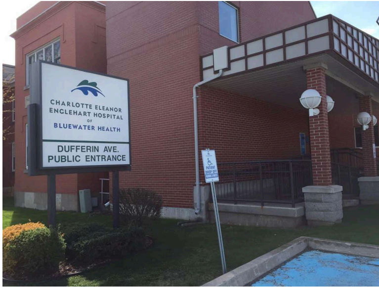
CEE Hospital Petrolia File Photo April 2017