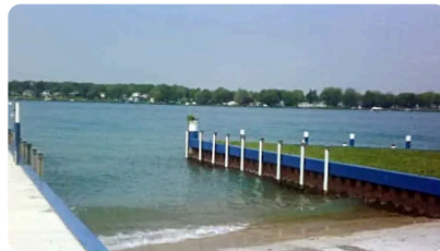
Boat destroyed by fire at Mooretown Launch Sarnia News Today