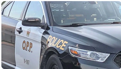
Impaired drivers arrested in two incidents on the weekend Sarnia News Today